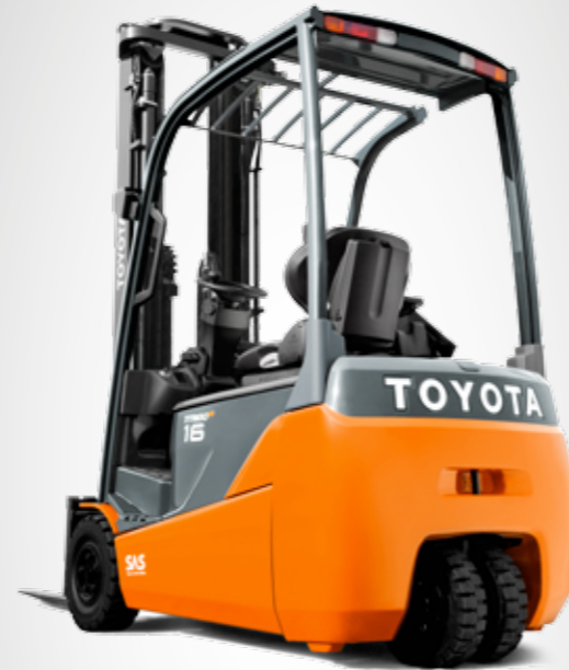
Toyota Traigo 48 48-volt 3 & 4-wheel truck

Powerful all-round trucks for light to more intense use 1.5 – 2.0 tonnes load capacities Travel speed up to 20 km/h Battery capacity up to 750 Ah