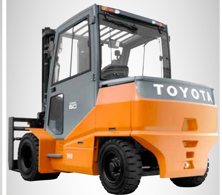
Toyota Traigo HT 80-volt 4-wheel truck

Class-leading strong, high performance trucks – perfect for heavy-duty applications 6.0 – 8.5 tonnes load capacities Travel speed up to 16 km/h Battery capacity up to 1250 Ah