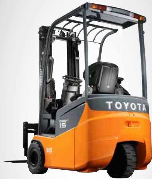
Toyota Traigo 24 24-volt 3-wheel truck

Compact design ideal for use in space-restricted areas 1.0 – 1.5 tonnes load capacities Travel speed up to 12.5 km/h Battery capacity up to 1000 Ah