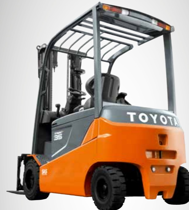
Toyota Traigo 80 80-volt 4-wheel truck

A tough design to handle heavy loads or multiple pallets safely and quickly 2.0 – 5.0 tonnes load capacities Travel speed up to 20 km/h Battery capacity up to 775 Ah